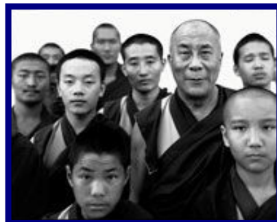
His Holiness the Dalai Lama at the Gyume Tantric Monastery, Kamataka, India, Jan. 6, 1998.

In that light, it is possible to forget that the Dalai Lama is, in fact, a titan: a head of state, a doctor of metaphysics, a prolific author, a hyperrealist, a newshound, a godhead to the Tibetan people and the recipient of the Nobel Peace Prize — a man who embodies a "simplicity that lies not before complexity but on the far side of it."