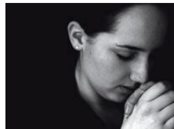
Prayers indeed heal diseases, scientists say

"Water differentiates the level of people's belief," Angelina Malakhovskaya said. "When a priest consecrates water, the optical density is 2.5 times more, when it is done by a religious layman, it is only 1.5 times more, but with a christened and unbelieving man without a cross on his neck, the changes were insignificant."