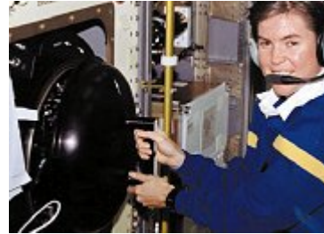
Above: Astronaut Janice Voss (the sister of co-author Linda Voss) monitors a combustion experiment onboard shuttle Columbia in 1997.

combustion: lean-burning engines for cars and airplanes; explosion hazards in mine shafts and chemical plants; emissions from cars and coal-burning plants; arson investigations. The list is long ... and it doesn't stop on Earth.