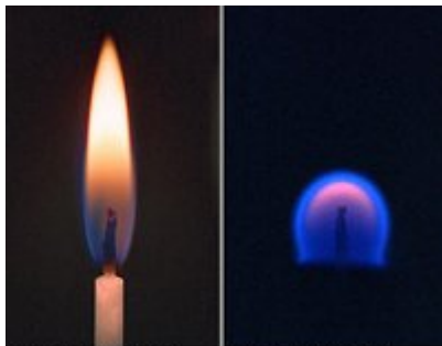
A candle flame in normal gravity.

Computer models had predicted the flame balls would be small and either extinguish or drift into the chamber walls in a few minutes. Instead they were two to three times larger than predicted and burned for over 8 minutes until the experimental system automatically extinguished them. Furthermore, although the flames were large, they were the weakest ever seen--emitting little more than 1 watt of thermal power.